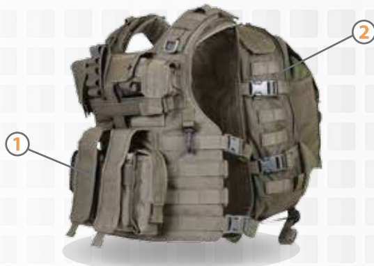
With 30 liter bag